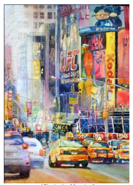
"City in the Morning"

umbrellaed market on a sunlit street. She made time to answer questions, and we all walked away with additions to our skill levels!.